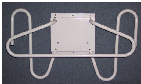
Wall Mount Single Rack