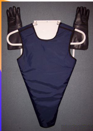
Wall Mount Single Rack with Gloves