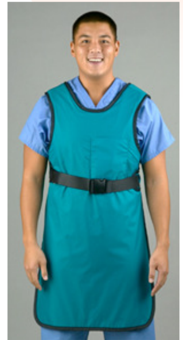
Radiation Protection Lead Aprons Front Buckle Apron

Lightest weight full protection x-ray gowns!