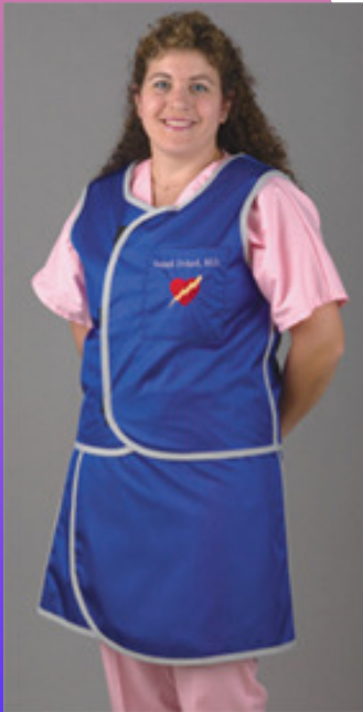
Radiation Protection Lead Aprons Full Two Piece Front

Looking for a lightweight, full protection, no lead x-ray gown?